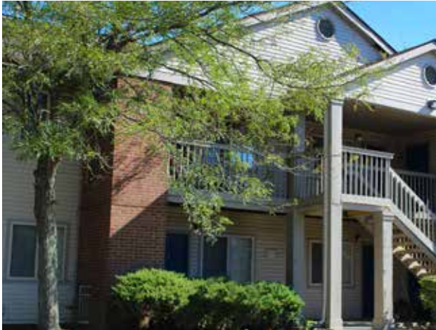
EAGLE CREST Galloway, OH