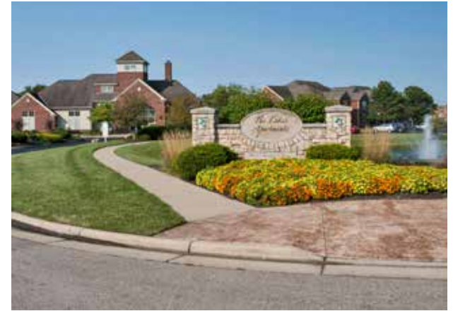
THE LAKES AT WEST CHESTER VILLAGE West Chester, Ohio