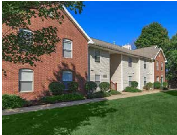
BIG SKY PARK Wadsworth, OH