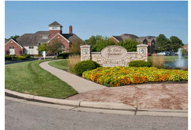
THE LAKES AT WEST CHESTER VILLAGE West Chester, Ohio