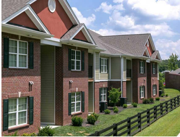
OVERBROOK APARTMENTS Louisville, KY