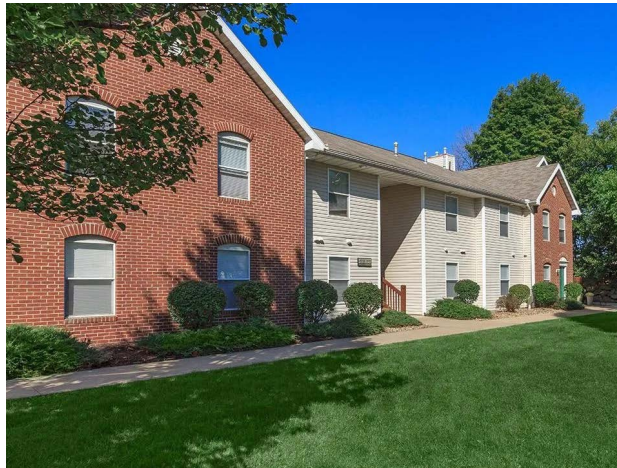
BIG SKY PARK Wadsworth, OH