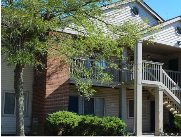
EAGLE CREST Galloway, OH